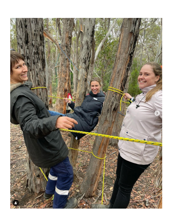
Top Nature Moment Number 2

Our Whole of Organisation Training got our Dodges Ferry teachers out of their comfort zone setting their Preps a team challenge to build a waterproof shelter before I showed up with a bucket of "rain" []. Squeals of nervous excitement rang out through the bush as I called out "the storm is coming!!